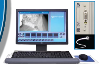
Fully Fiber Optic Digital Integration