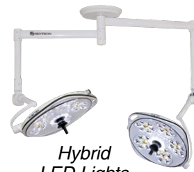
Hybrid LED Lights