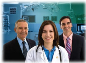
Financing & Equipment Acquisition