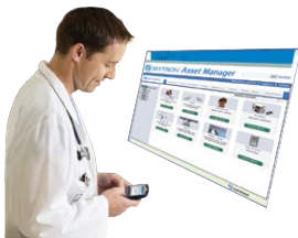
RTLS, RFID Asset Manager