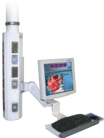
VBR - Monitor & Keyboard Mount