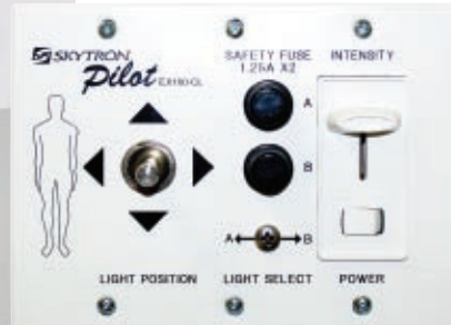
Pilot Wall Control featuring On/Off and Intensity Controls, A/B Toggle Switch with Joy Stick Controller