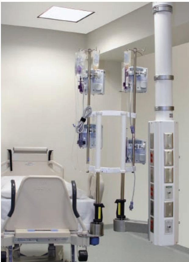
EZ-GO IV Transport aligned for speedy transfers from ICU bed to ICU boom & back again!