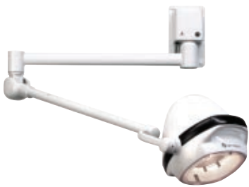
Stellar ST9W Wall Mount