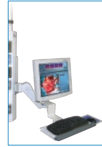
Monitor/Keyboard Mount H8-200-57