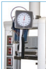
Aneroid Manometer with Basket H8-200-39-1