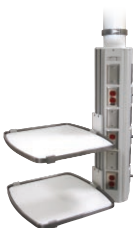
VBR - Extended Shelves with Equipment Rail