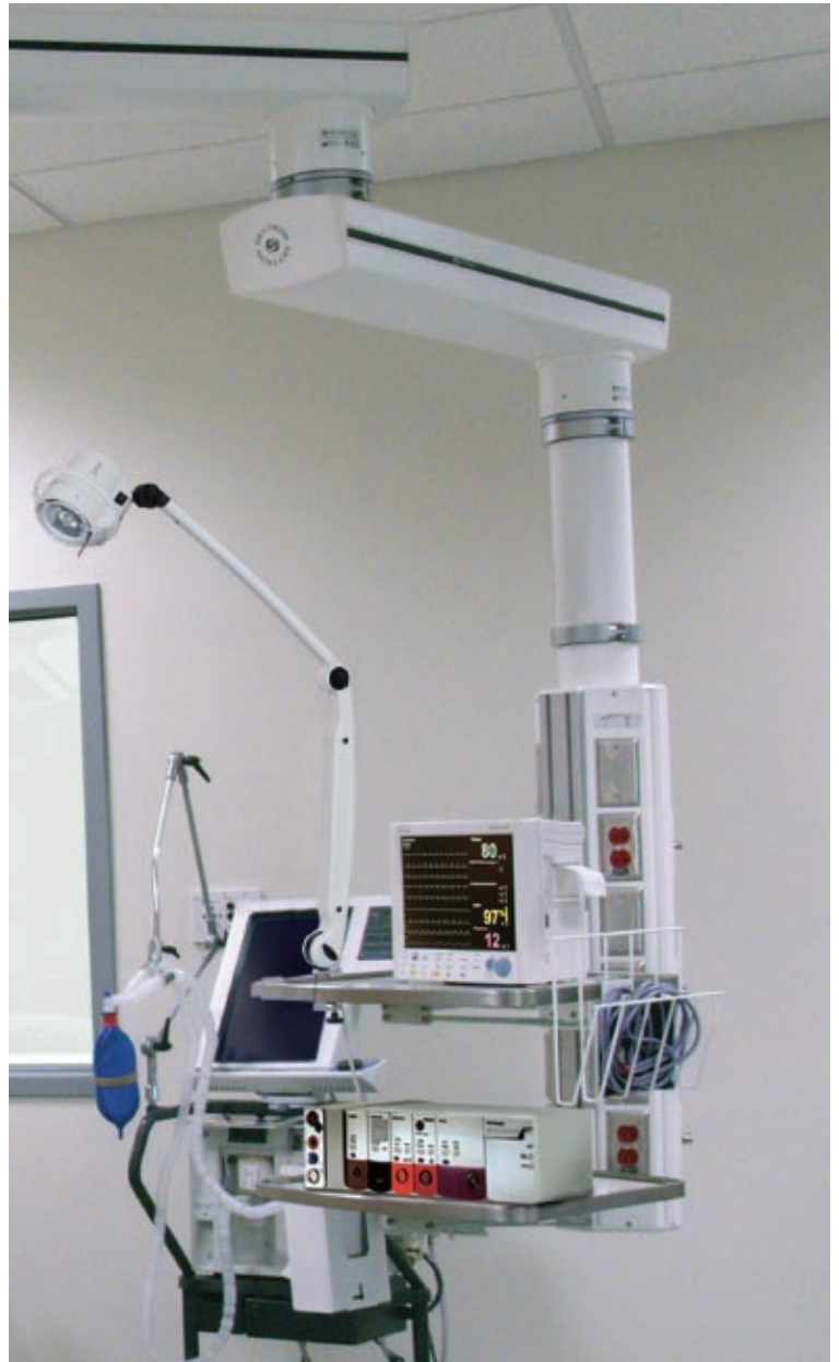
VBR Ergon Skyboom featuring extended, track adjustable shelves and shelf rail mounted Halux Exam Light.