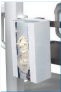
Glove Box Holder H8-200-41-1