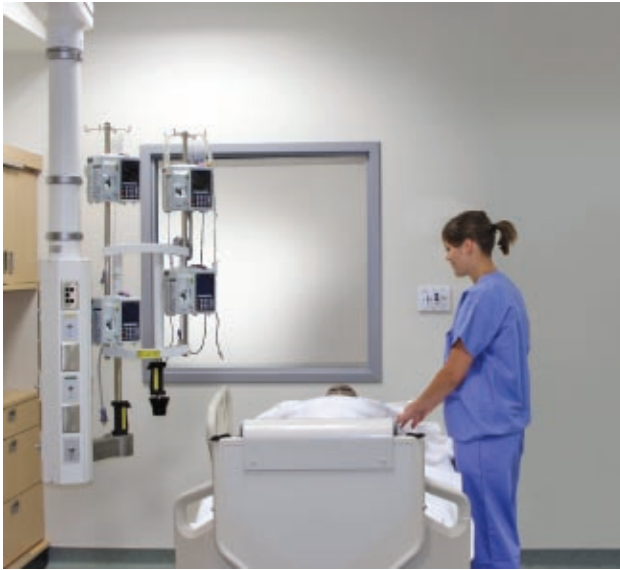
EZ-GO IV Transport requires fewer staff and provides safer transport flexibility!