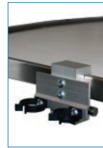
Double Tubing Clip H8-200-45-1