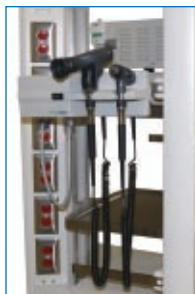
Ophthalmic & Otoscope Mount H8-200-37-1