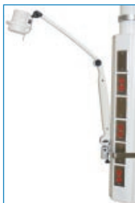
Halux Exam Light (Boom Mounted)