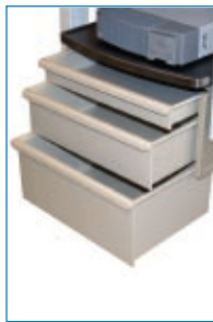
3 Drawer Storage System H8-200-48