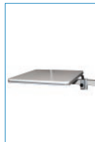
Bedside Charting H8-200-40-1