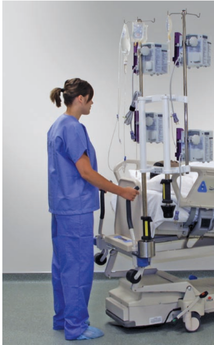
When it comes to patient transport on or off the Intensive Care Unit, Skytron's EZ-GO IV Transport is ready to go whenever you are!