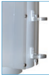
CO2 Bottle Holder H8-200-08