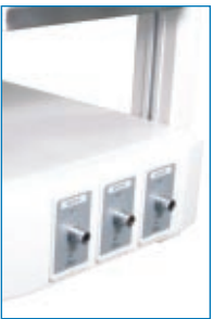
Base Utility Box H8-200-18 (K Carrier)