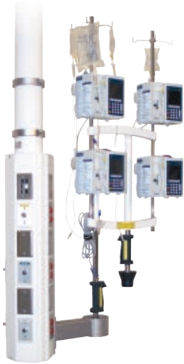
VBR - EZ-GO IV Transport

Skytron's VBR Skyboom offers flexible options to best meet clinical needs in a slim design, including optional extended shelves, monitor and keyboard mounts, EZ-GO IV Transport and more!