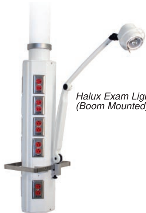
Halux Exam Light (Boom Mounted)