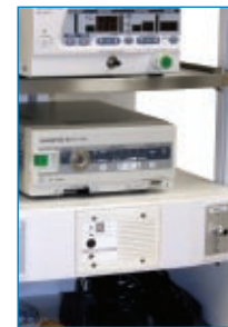
Nurse Call Adapter Plate Triple Gang H8-200-22