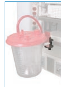
Vac Slide Rail Mount H8-200-07