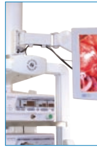
VST/Hub Monitor Mount H8-200-58