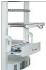
Pull Out Shelf and/or Drawer H1-220-50 H1-200-02 (P Carrier)