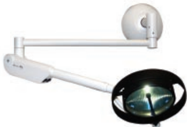
Iris IR7W Wall Mount