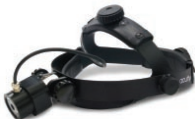
Acuity LED Headlight