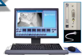
Fully Fiber Optic Digital Integration