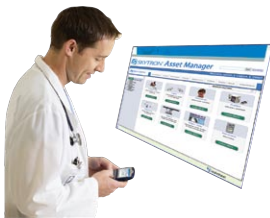
RTLS, RFID Asset Manager