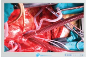
HD Flat Panel Displays