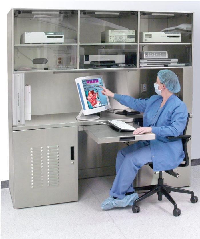
72" Wide Nurse Document & Communication Center (SORIC-72 shown)