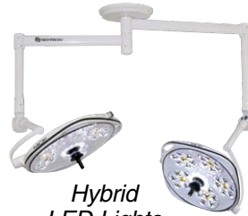
Hybrid LED Lights