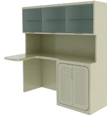
Solid Surface Cabinets