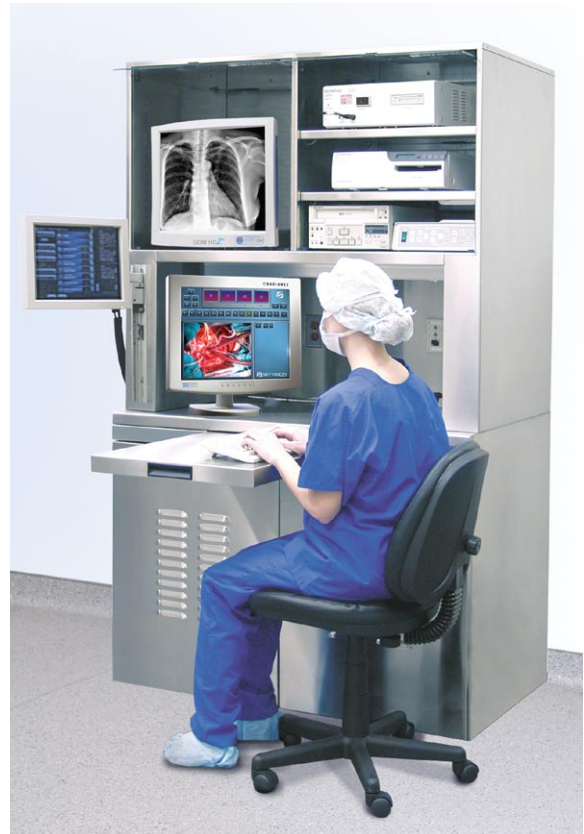
48" Wide Nurse Document & Communication Center (SORIC-48 shown)

Nurse Document and Communication Centers provide a universal control hub for advanced video and communications integration and other technologies both within and outside the Operating Room, optional teleconferencing, surgical and room lighting control and more. Phone, computer, video and electrical junction boxes are provided at convenient access points throughout the cabinet. A pull out, stow away shelf is built within the base design to permit the circulating nurse to face the surgical field during every surgical case.