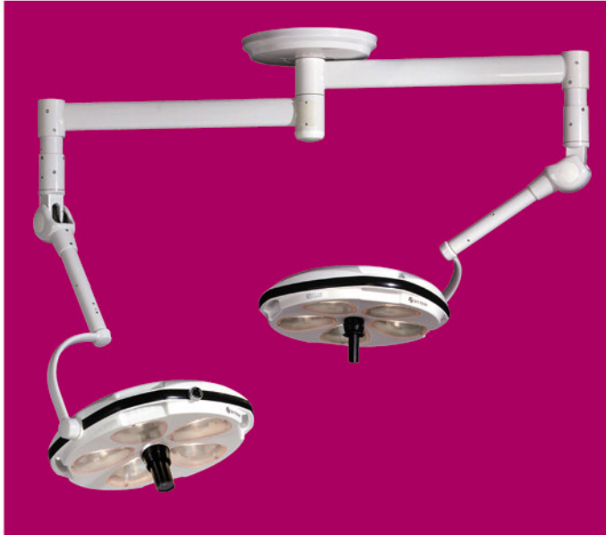
Stellar Lights with Camera (ST2323TV)